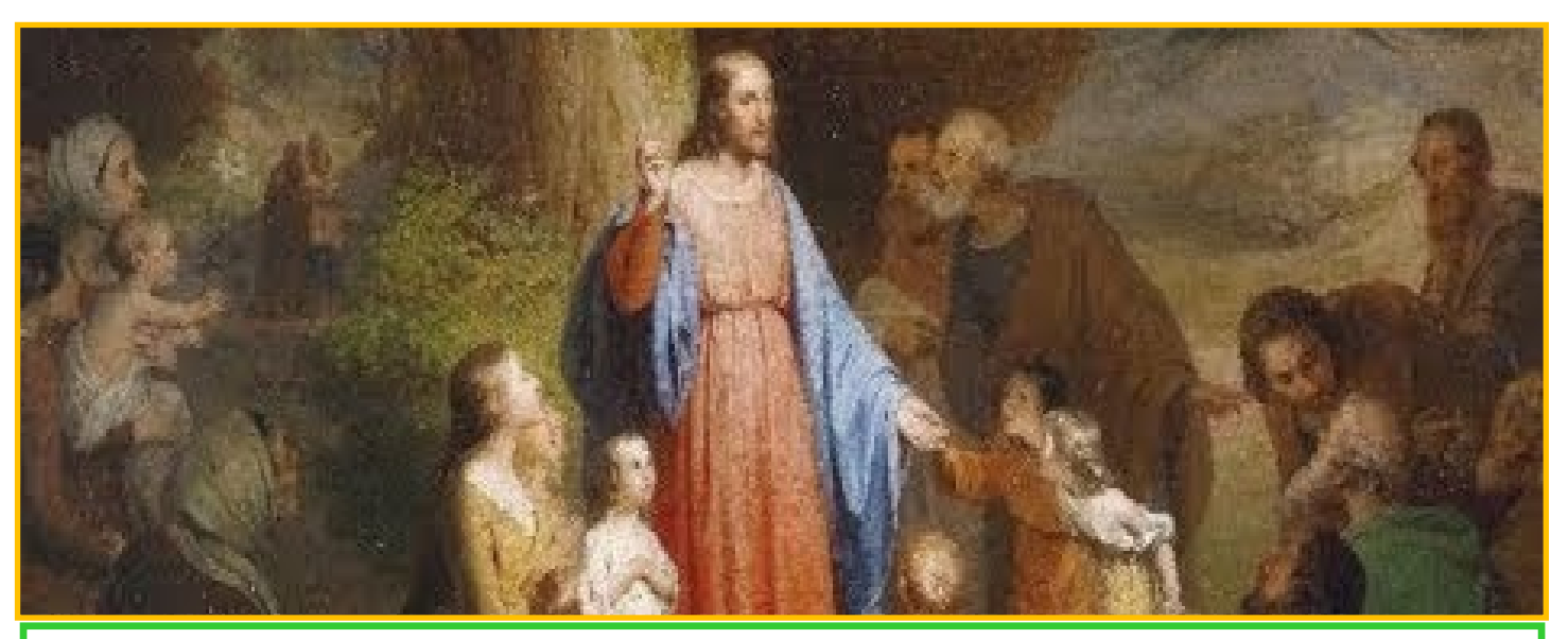
Sunday 7 October - 27th Sunday in Ordinary Time